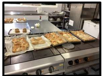
Our guests have arrived